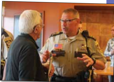
Residents and local police officers who didn't have a chance to meet at Night to Unite were able to share coffee and conversation on Tuesday, Aug. 18 at "Coffee with a Cop," held at Caribou Coffee in North Oaks.