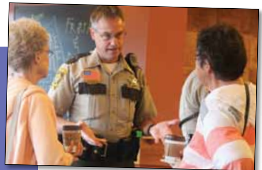
Local officers wanted to know what the citizens were thinking and, using coffee to start the conversation, residents were able to share their concerns and ask questions.