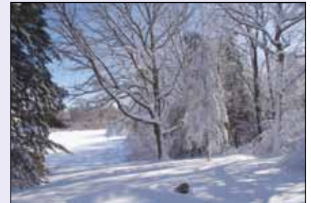
1ST PLACE: Snowy Morning on Shores of Lake Emily – Tom Reynen