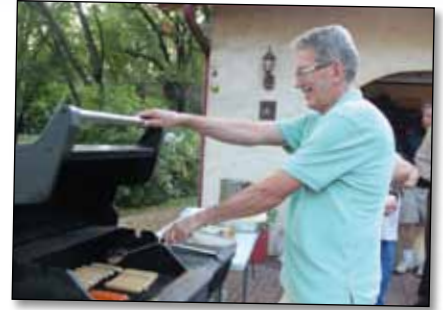
Neighbors spent the evening meeting, having dinner together and taking part in fun activities.