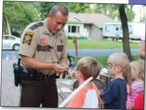
The Ramsey County Sheriff's Office, in collaboration with the Minnesota Crime Prevention Association and AAA of Minnesota/Iowa, once again sponsored Night to Unite to build and foster community bonds between citizens, businesses and public safety organizations.