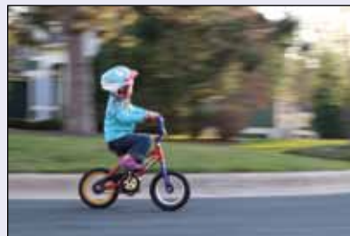
1ST PLACE: Girl Biking Through a Shoreview Neighborhood – Jeffrey Finc