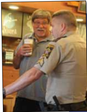
The Ramsey County Sheriff's Office offered this event for the first time in an effort to reach out and connect with the citizens they are serving and protecting.