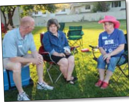
A record-breaking 64 registered parties – including 13 new events – were held around the City in perfect weather as residents worked together to make Shoreview a great place to live.