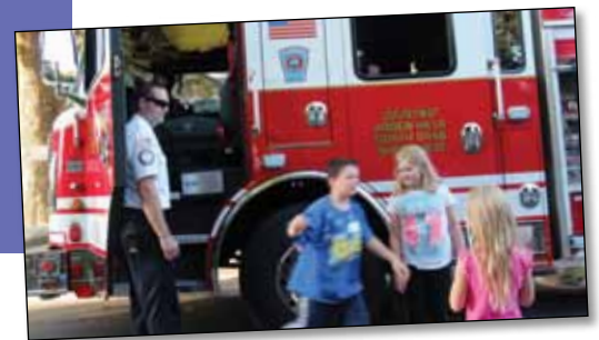
They also had a chance to meet public safety personnel from the Ramsey County Sheriff's Office and Lake Johanna Fire Department, as well as local elected officials and some local businesses.