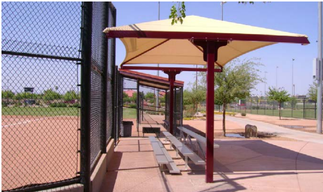
Shade for spectators & players

“ A covered hockey rink would be perfect right here. Will provide a lot less soft ice and issues maintenance wise.