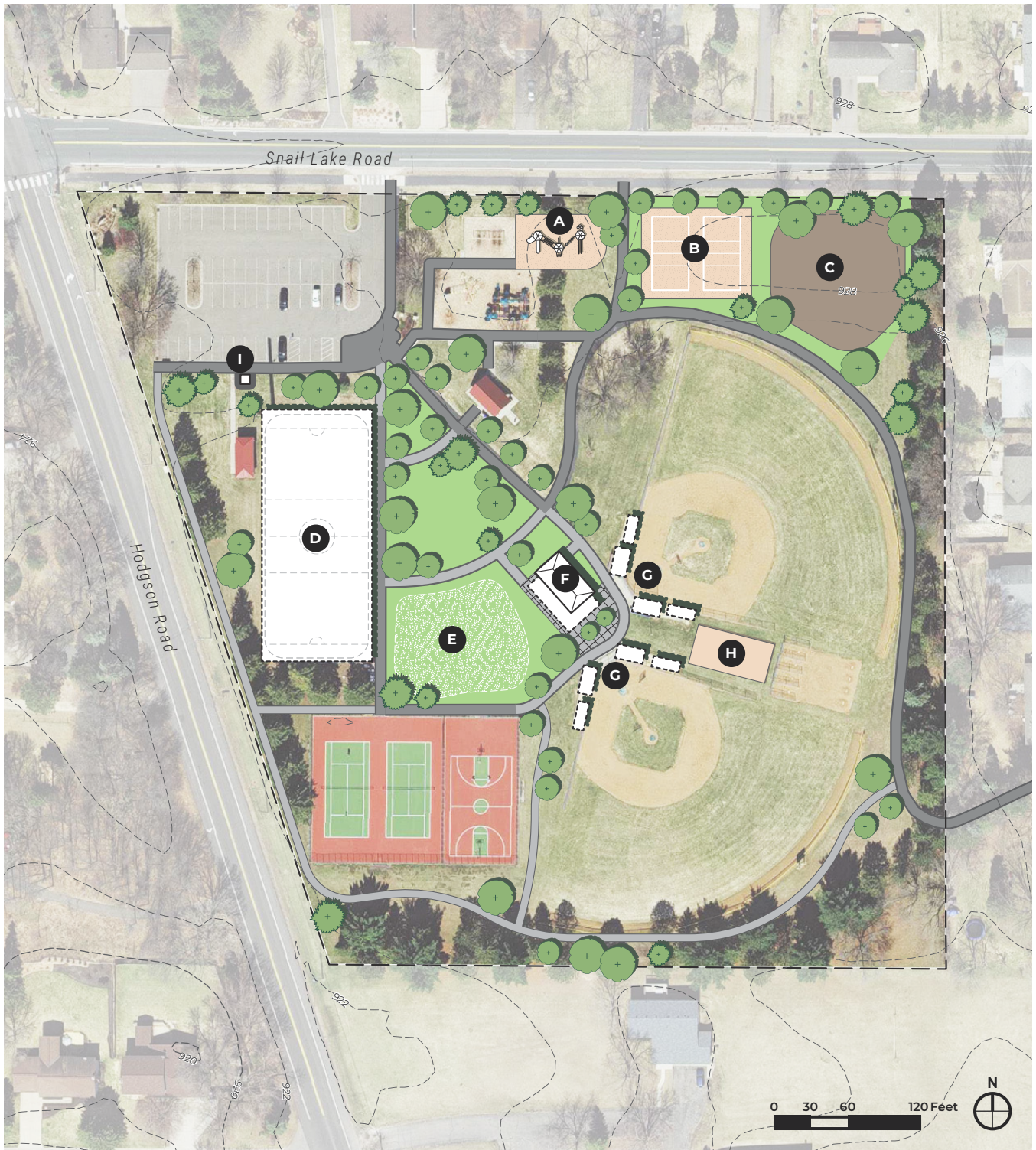
Figure 4.21 Sitzer Park proposed concept