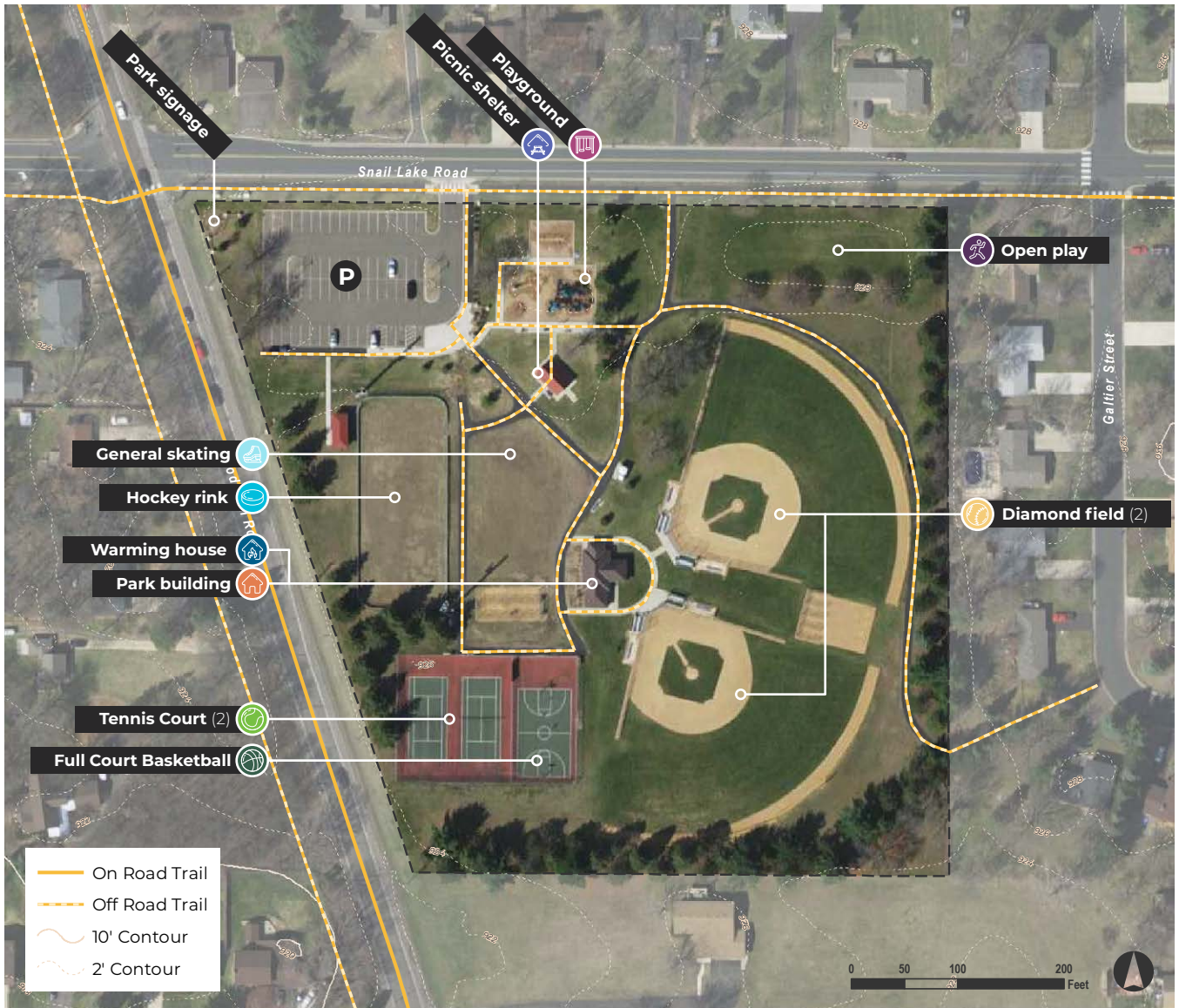
Figure 4.20 Sitzer Park existing conditions