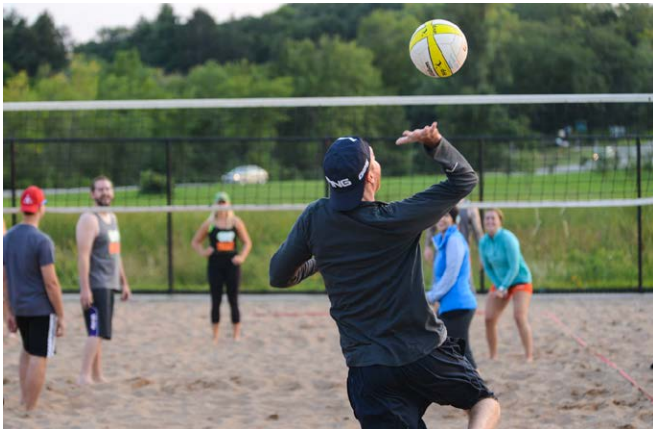
Sand volleyball court