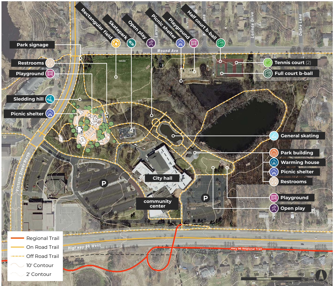
Figure 4.18 Shoreview Commons existing conditions