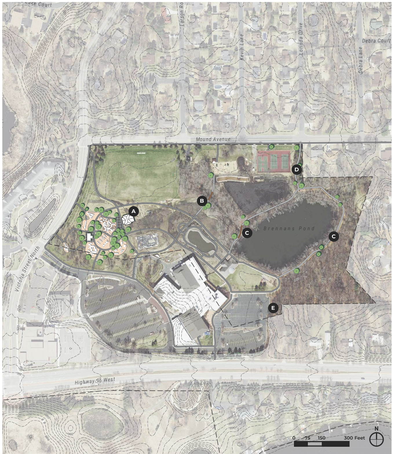
Figure 4.19 Shoreview Commons proposed concept