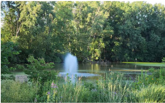
Complete trail loop around Brennans Pond with paved trail and boardwalk