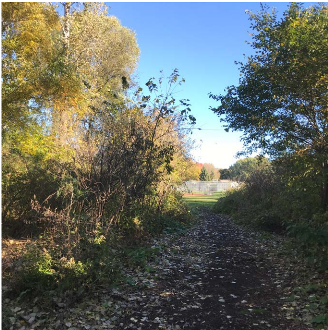
Existing informal trail connection in northeast portion of park