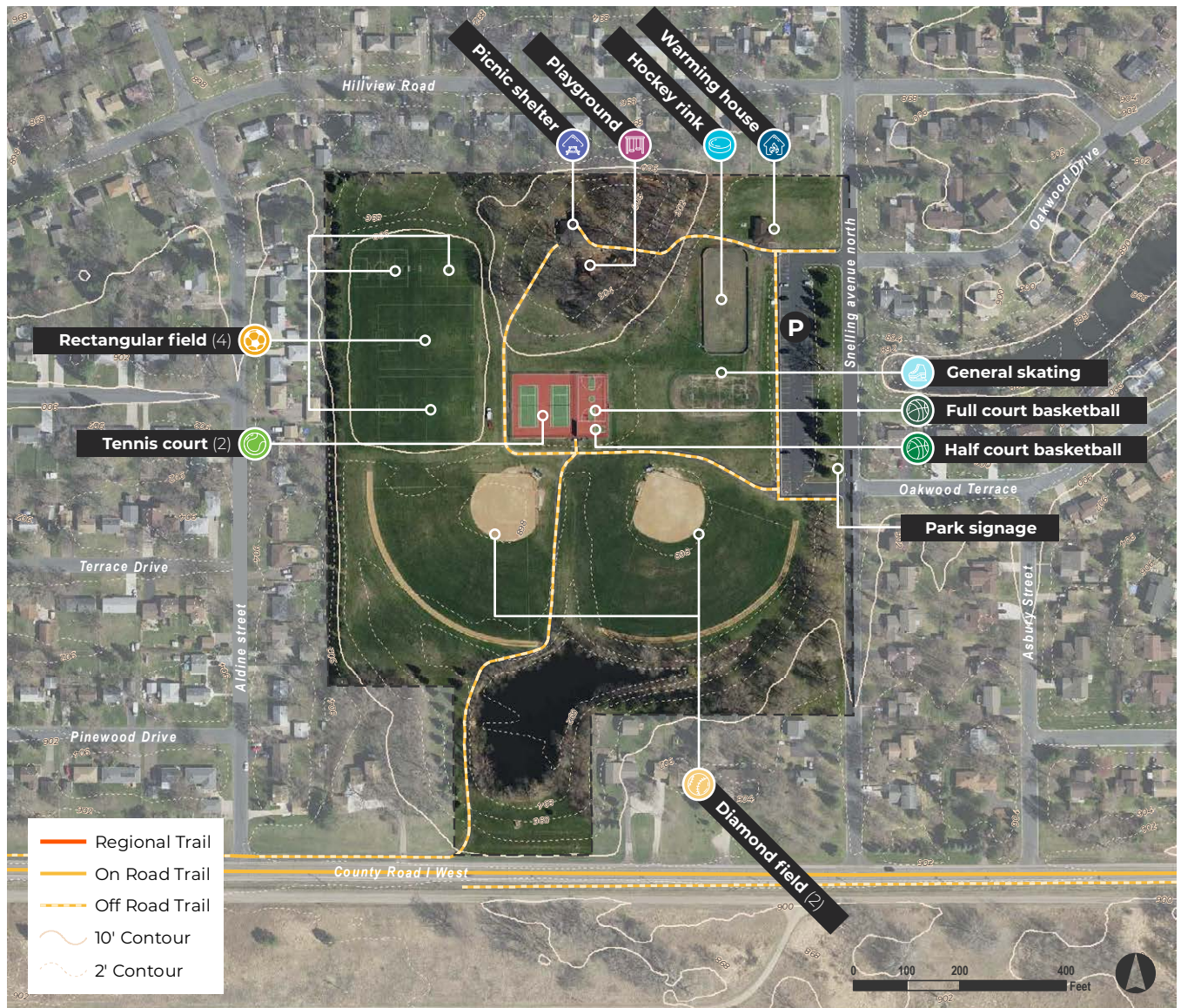
Figure 4.16 Shamrock Park existing conditions