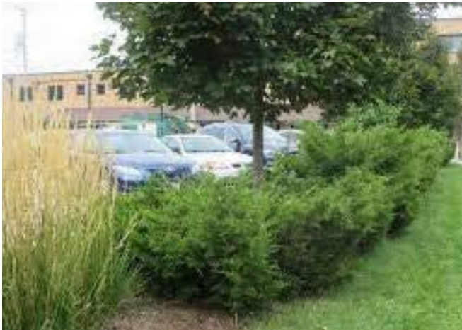
Vegetative buffers around parking lots