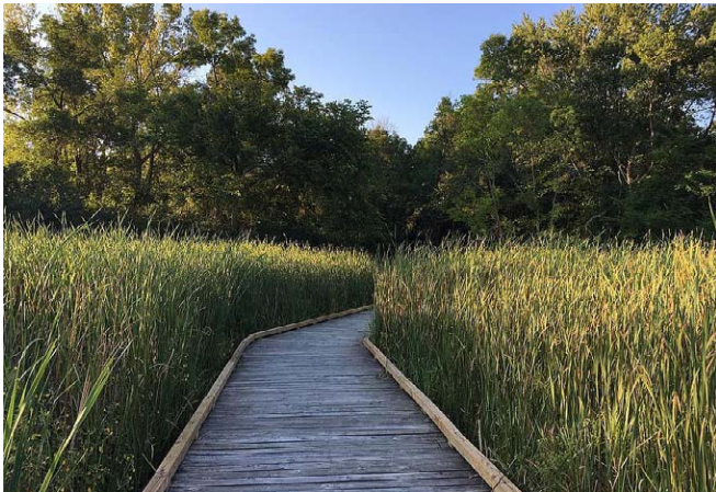
Wetland boardwalk at Westwood Hills Nature Center in St. Louis Park

“ Please do not add a domed structure to Shamrock Park.