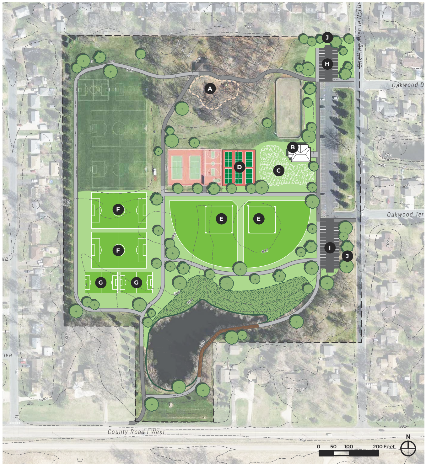
Figure 4.17 Shamrock Park proposed concept