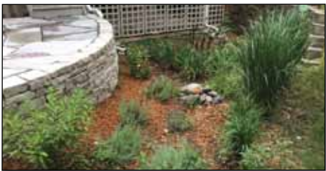
Wing Lai and Wai Wong-Lai

Many rain gardens are in sunny spots filled with sun-loving plants. What makes the Zerfas' rain garden so special is that it is in a shaded spot where water didn't used to soak in. Instead it either made a muddy mess or ran off and over an adjacent path. Now the Zerfas have a lovely space to spend the evening and lovely plants to enjoy.