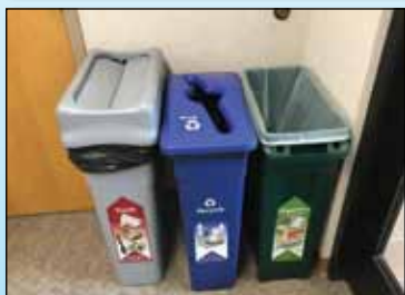
Shepherd of the Hills Lutheran Church

The judges agreed this was the most comprehensive green program they have seen. It starts when you see the large rain gardens that infiltrate rain water that used to cause severe erosion. Inside the church there's even more. They have replaced most of the lighting with LED bulbs saving a substantial amount of money. The church also has a commercial kitchen that they share with other organizations. They added organics recycling and diverted a substantial amount of compostable material that used to go in the trash.